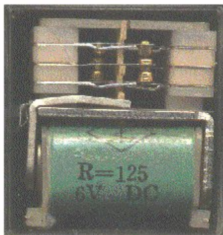
Relay showing coil and switch contacts