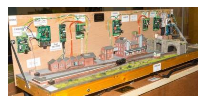
MERG Home page Public Pages Index Area Groups News Members Only Area