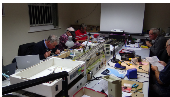
Pictures from recent JMRI and CBUS courses at Rushden Transport Museum

Rushden Transport Museum is signposted from the A6 Rushden bypass and parking is available directly outside: