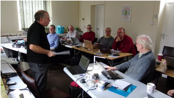
Pictures from recent JMRI and CBUS courses at Rushden Transport Museum

Rushden Historic Transport Society (RHTS) are based at the restored Rushden Station. They recently acquired the historic goods shed across the road, it having previously been in use as a council depot, which now forms part of the Rushden Transport Museum and Railway. See www.rhts.co.uk for more information.