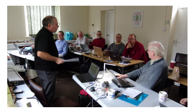
Pictures from recent JMRI and CBUS courses at Rushden Transport Museum

Rushden Historic Transport Society (RHTS) are based at the restored Rushden Station. They recently acquired the historic goods shed across the road, it having previously been in use as a council depot, which now forms part of the Rushden Transport Museum and Railway. See <u>www.rhts.co.uk</u> for more information.