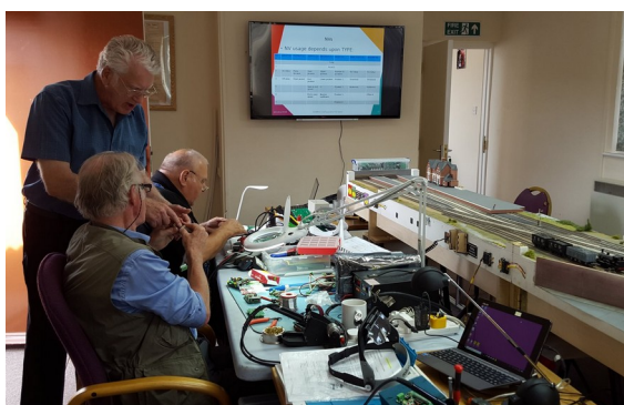
The pictures are from a recent “More CBUS” course at Rushden Transport Museum

Rushden Historic Transport Society (RHTS) are based at the restored Rushden Station. They recently acquired the historic goods shed across the road, it having previously been in use as a council depot, which now forms part of the Rushden Transport Museum and Railway. See www.rhts.co.uk for more information.